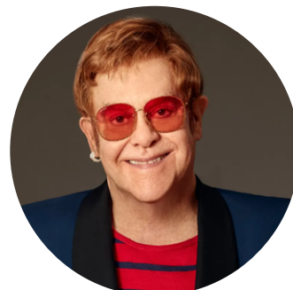
Elton John Singer & Songwriter

“I finally summoned up the courage to say three words that would change my life: “I need help.” Thank you to all the selfless people who have helped me on my journey through sobriety. I am eternally grateful.”